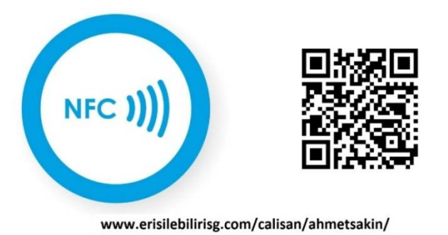
Figure 6. NFC and QR code access tags for an employee (Ahmet Sakin) file.

Other file access tags besides the equipment file access are also given below.