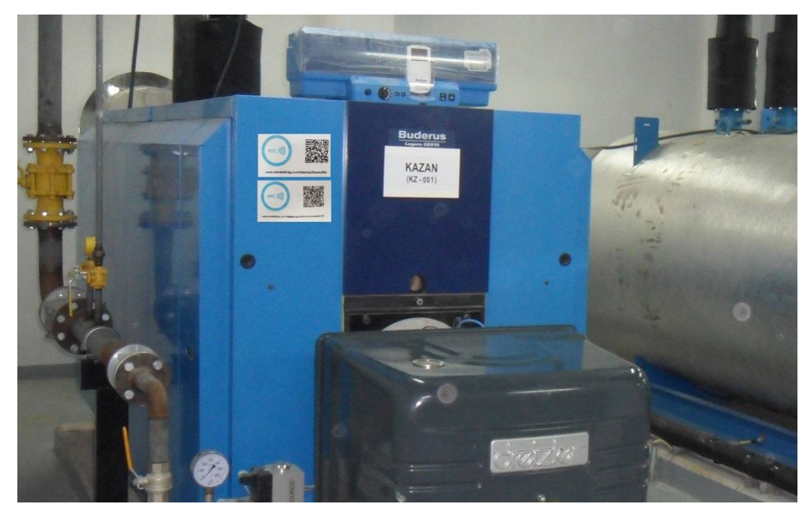
Figure 5. Picture of tags applied on the boiler.

Three different methods of accessing the file with link in tags are provided. It is possible to access file with written link text and NFC, QR code tags. Since it is not easy to entering text in the field, QR code tag is used as a secondary access method. But for this an extra QR code reader program is required. With the NFC tag, which is the main access method, approaching NFC compatible mobile phone to the tag is just sufficient. In this way it is possible to easily access the equipment file and check at the field.